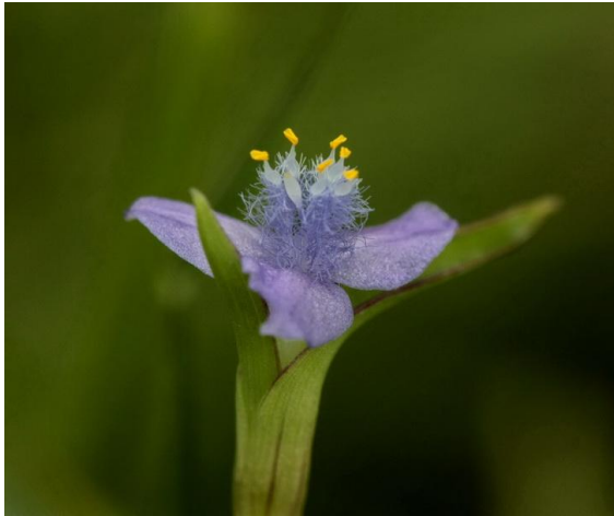
Cyanotis axillaris , Commelinaceae, Blue Ears

A common, local, small tree, Alectryon connatus was also viewed in flower and with immature fruit, which was a first for many of us.