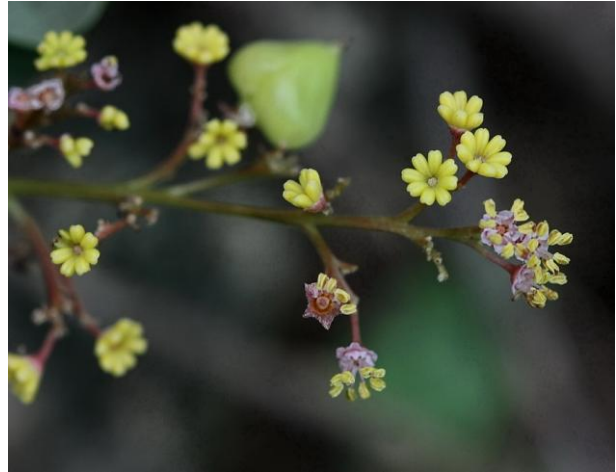
Neptunia major , Mimosaceae