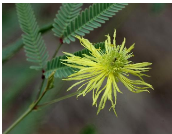
Alectryon connatus , Sapindaceae, Hairy Alectryon