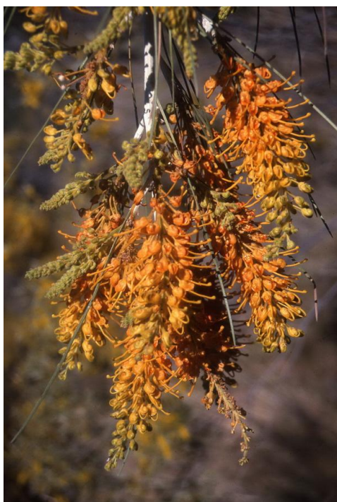
Grevillea juncifolia NT