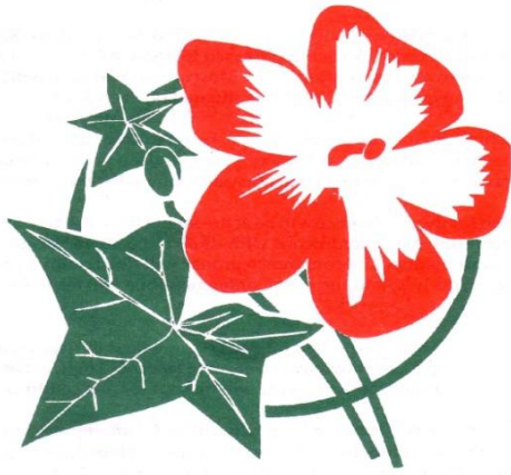
Abelmoschus moschatus ssp tuberosus